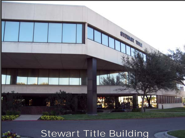
Stewart Title Building

Stewart Title Building Space Available 5656 S. Staples Street, Corpus Christi, TX 78413